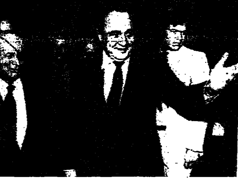
West German Foreign Minister Hans-Dietrich Genscher shows his Israeli counterpart, Moshe Dayan, into his Bonn office yesterday.